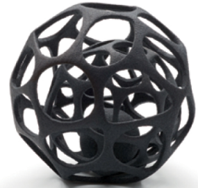
Picture taken after dye post-processing

Robust thermoplastic that optimizes part quality with cost, producing strong structures