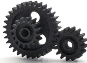
Picture taken after dye post-processing

Get precise small features and detail such as small fine holes, walls and shafts with dimensional accuracy thanks to HP's unique Multi-Agent printing process